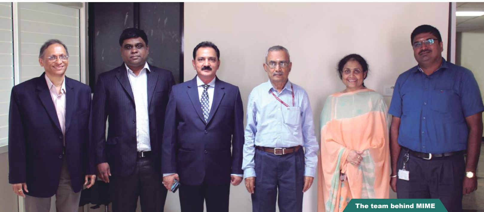
The team behind MIME

K PMG, IBM, FedEx, Deloitte, Target, Radio Mirchi. These are but a few of the many corporate giants that anxiously wait for the recruitment season to get their hands on capable and certified young talents who are au courant about the corporate world. There is one particular place where corporate giants from all fields of business come back every year. Located in Bangalore, Karnataka, MATS Institute of Management & Entrepreneurship (MIME) is crowded with recruiters every year in the hopes of recruiting the cream of the crop.